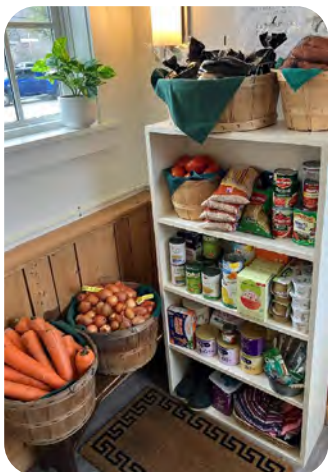
Little Rivers Food Shelf