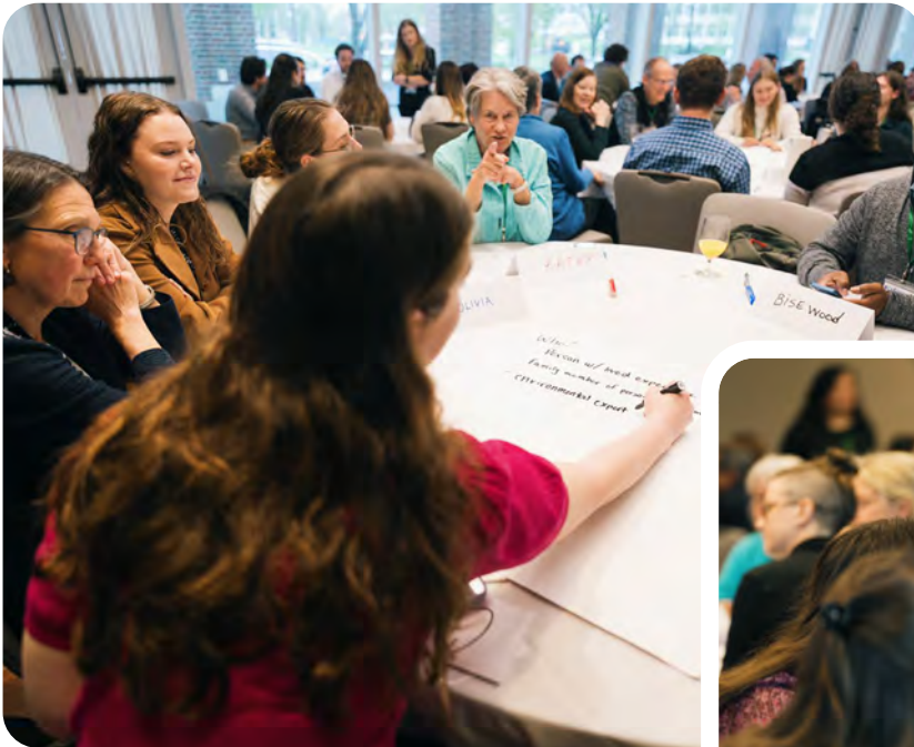
Rural Health Symposium 2025