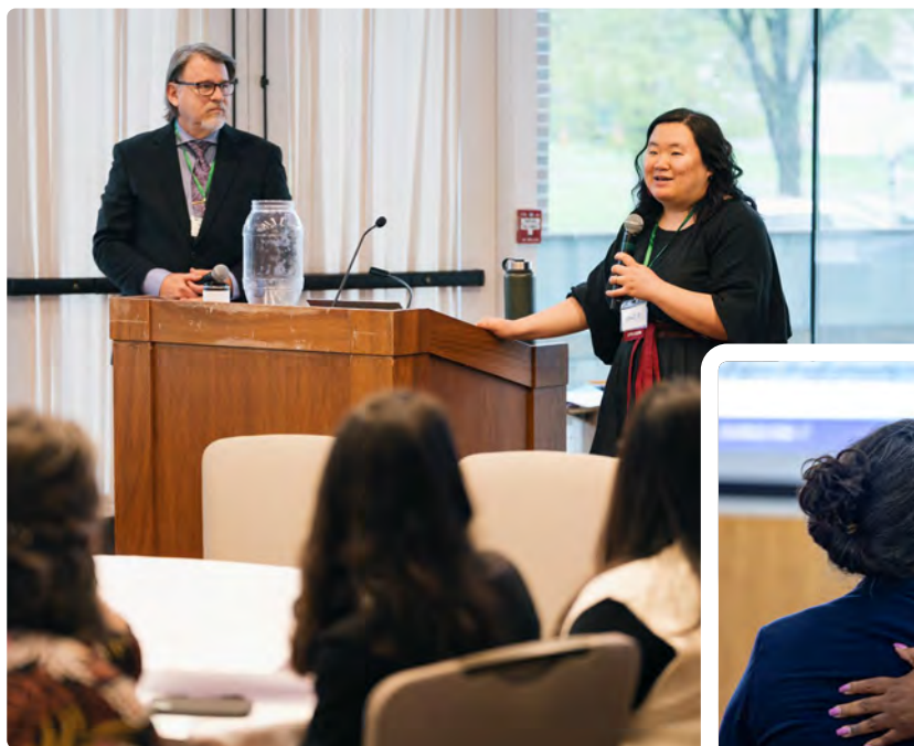
Rural Health Symposium 2025

As we embark on our strategic plan in 2026, we remain committed partnering and working together with our communities to improve rural health equity.