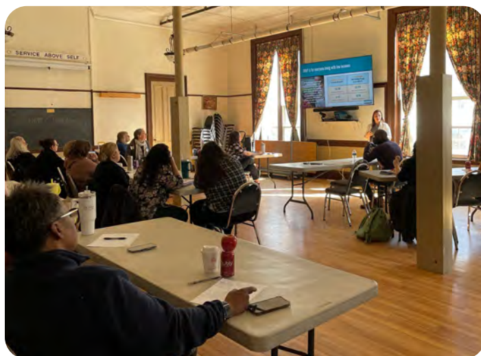
Fall Mountain Food Summit