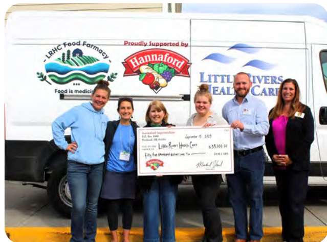
Little Rivers van